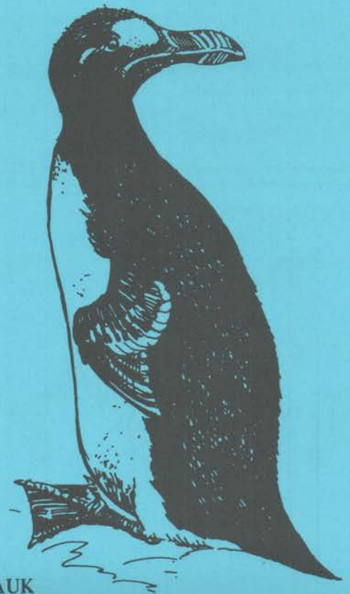
THE GREAT AUK

In this country many zoos and wildlife parks are successfully breeding creatures whose lives are threatened in their natural surroundings. Through their education programmes the wildlife parks allow people to learn about such animals and the need for conservation. Places such as Pencyrnor are a ‘safe’ home for many kinds of animals that would otherwise face extinction. In the future, when perhaps their natural environments may be safe again, many of these species can be put back into the wild.